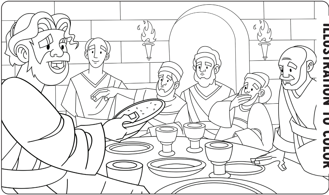
ILLUSTRATION TO COLOR